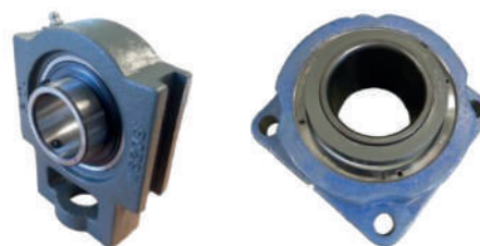
UCT 208 and bearing flanged