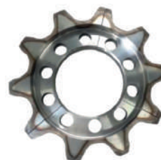
Segmented teeth pitch 124 and 150 for monochain